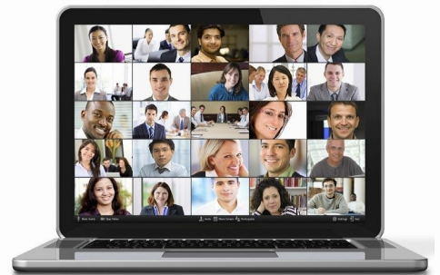
On-Line Adult Sunday School & Life Group

These differences have increased the costs of being The Church. In addition to the increased costs, the way we participate financially might also need to be different. The switch to on-line streaming of our worship service has caused a precipitous drop in offerings. We normally average $12,000 per Sunday. Last Sunday we only received $1,000. The previous Sunday we received roughly $3,500. You are encouraged, as you are able, to continue presenting your offerings to God as an act of worship. The Coronavirus may have disrupted the way we exercise our faith, but it hasn't changed the content of our faith.