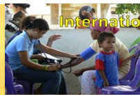
International Friends of Compassion Hohidiai Mission