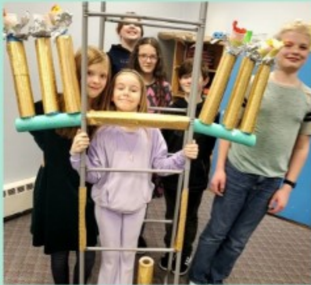
Roots Club built a scale model of the Tabernacle Lampstand

Dear First Pres. Folks, One thing about Children's Ministry is we are all about LEARNING. Sunday school classes spent the month in the book of Daniel (Check out the bulletin board Malder by our late elementary kids). Roots kids continued in their study of the OT Tabernacle to increase their understanding of God's hopes for his people. Climb Middle School group launched into Confirmation classes and just completed a lesson on the Prophets. As we launch into Easter season we hope that you'll invite the kids you love to Eggstravaganza so they can know us better and begin to learn the most important thing: Jesus loves you, and He can teach you to love others